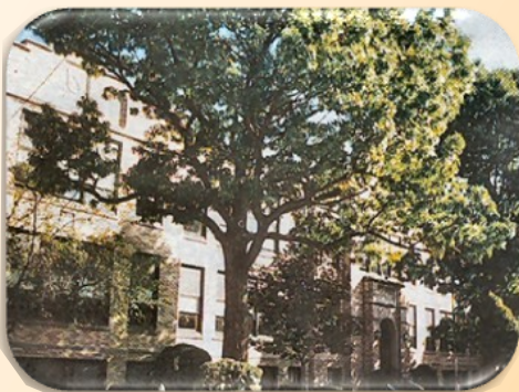
Saint Peter's Elementary School