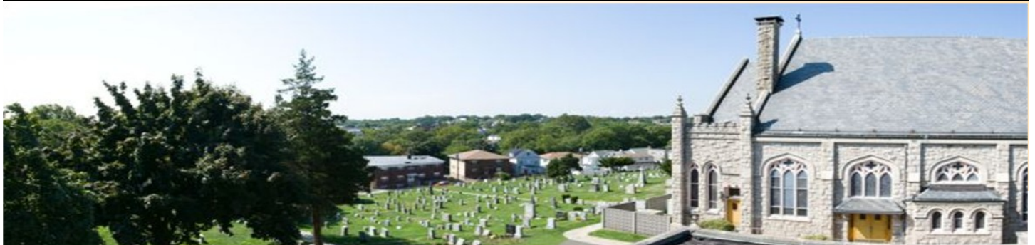
Bird's eye view of Saint Peter's Church and Cemetery.