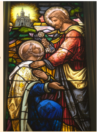
Detail from first stained-glass window at Saint Peter's Church, Tabernacle side.